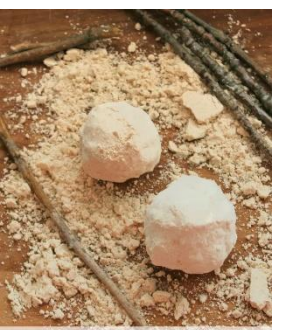
Cinnamon & Ginger Cloud Dough Recipe {for sensory play}

Directions: Put 4 cups of flour into a large bowl. Make a hole in the center of the flour and pour the oil in to it. Mix together with your hands so that all the flour becomes lightly coated with oil and the mixture begins to form a texture. Add a pinch of cinnamon and a pinch of ginger and mix thoroughly. It's play time!